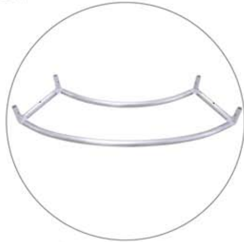
Qty 1 - Bottom Base