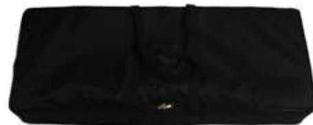
Nylon Carry Bag