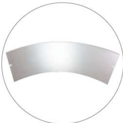
Qty 1 - Acrylic Top Counter