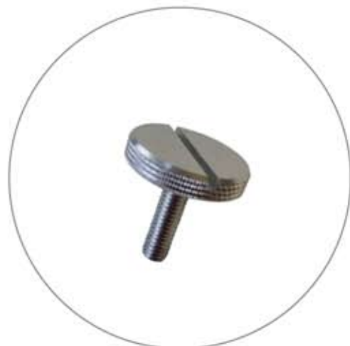
Qty 2 - Large Head Bolt