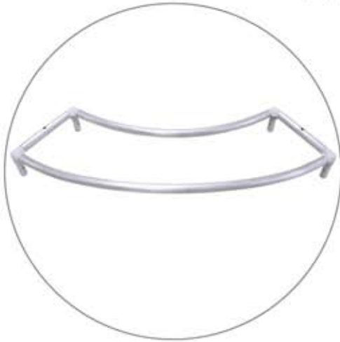
Qty 1 - Top Base (Pre-drilled for acrylic counter)