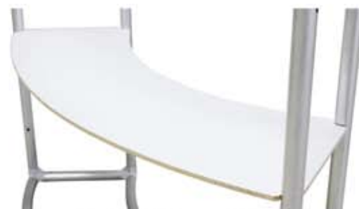
Optional Curved Shelf