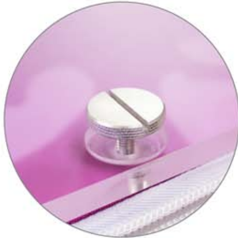
Insert head bolt.