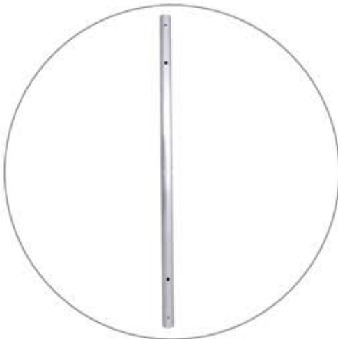
Qty 4 - 33" Vertical Support Bar