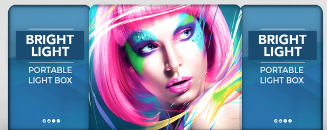
BrightLight LED Backlit Display-5ft + (2) 3ft