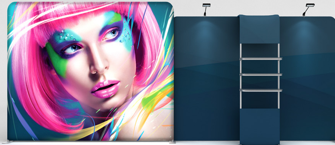
BrightLight LED Backlit Display-10ft + BlockStyle Display-10ft + BlockStyle Waterfall Shelf Kit