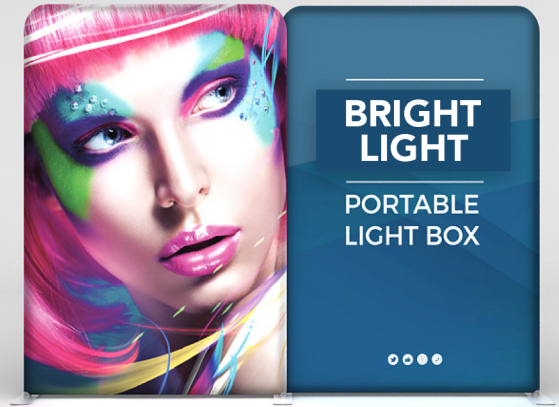
(2) BrightLight LED Backlit Displays-5ft

FiV products are a great option to add your own custom environment with monitors, brochure holders, counters and many more creative solutions.